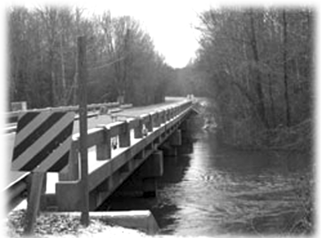
Photograph of flooding on the Mattaponi River courtesy of the USGS.